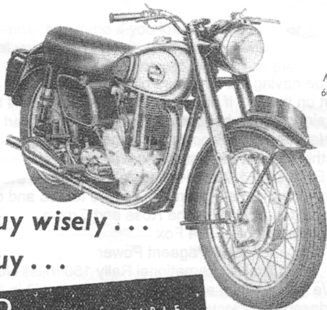
Model 19s. 600 O.H.V.