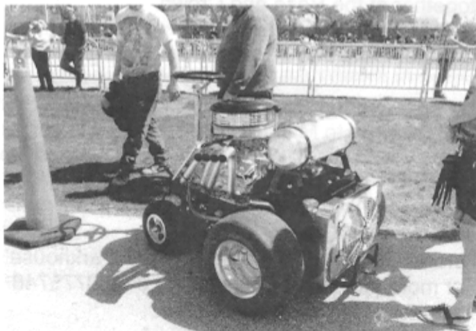
A 480 B.H.P. V-EIGHT BAR STOOL. YOU SIT ON THE AIR FILTER IT WENT LIKE HELL DOWN THE TRACK